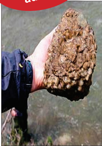
Didymo, a freshwater algae found in New Zealand waterways, is not present in Tasmania.